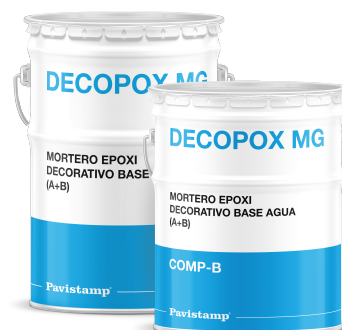
Decorative epoxy mortar water based (A+B)