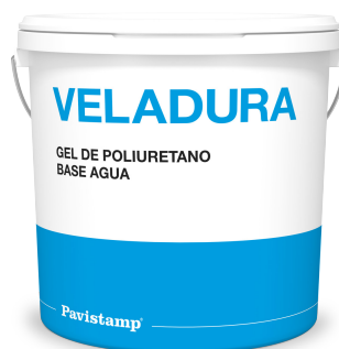
Polyurethane gel water based