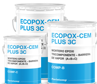
Three-component epoxy mortar Vapor barrier (A+B+C)