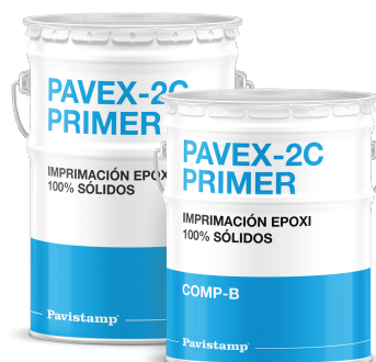
Epoxy primer 100% solids