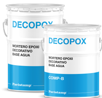
Decorative epoxy mortar water based