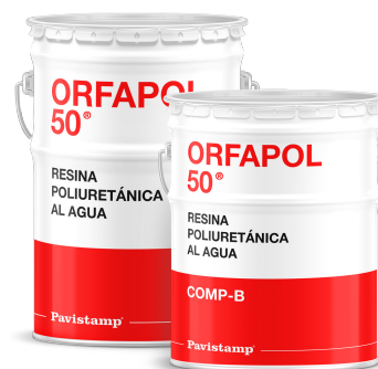
Polyurethane resin the water